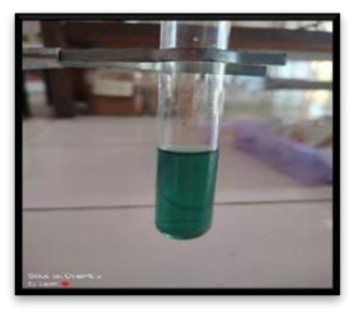
Figure 2: Chemical test of clove oil

i) A drop of clove oil is dissolved in 5ml alcohol and a drop of ferric chloride solution is added; due to the phenolic OH group of eugenols, a blue colour is seen.