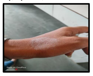
Figure 10: Skin Irritation Test