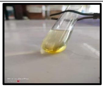
Figure 4: Chemical test of cinnamon oil

Volume:06/Issue:07/July-2024 Impact Factor- 7.868 www.irjmets.com