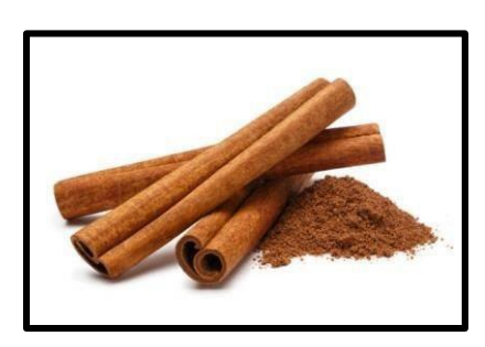
Figure 3: Cinnamon bark