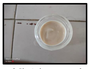
Figure 8: Physical appearance of cream

F1: white with consistency and soften in nature.F2: white with consistency and soften in nature.