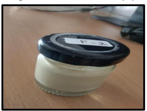
Figure 6:- Formulation of cream (F2)