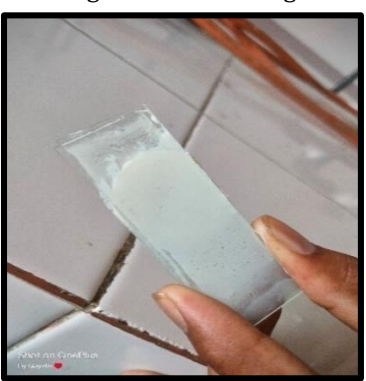
Figure 9: Spreadability test

Where, m = weight applied to upper slide.l = length moved on the glass slide. t = time taken