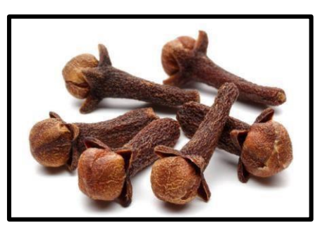
Figure 1: Clove buds

Kingdom: Plantae Division: Magnoliophyta Class: Magnoliopsida Order: Myrtales Family: Myrtaceae Genus: Syzygium Species S. aromaticum