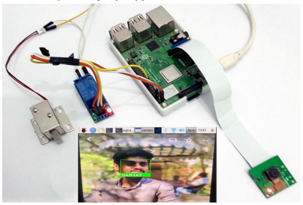
Fig 3: Complete project.

The Result of this project is showed in below photos: If raspberry pi recognizes a face, it will open the door lock and send an email alert.. Here, a solenoid lock and a Pi camera will be used with Raspberry Pi to build this face recognition-based door lock system using Raspberry pi.