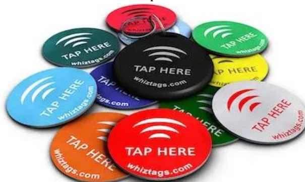
Fig 6: NFC tag

NFC is a ton like RFID, just it's a more very close sort of wireless. Whereas RFID can be utilized from a separation, NFC perusers work at a most extreme scope of around 4 inches (10 centimeters). Tap the tag, and you're coordinated to a Web webpage routing a competitor's qualifications. In the meantime, you additionally right away get a smart account as a content record and picture.