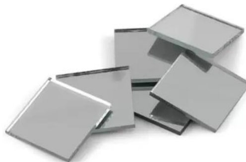
Fig 5: Acrylic mirror

Acrylic Mirror is a lightweight, reflective thermoplastic sheet material used to improve the look and security of showcases, POP, signage, and an assortment of created parts. Acrylics reflect is perfect for retail, sustenance, promoting, and security applications. A sturdy vacuum metalizing process makes acrylic reflect sheet for all intents and purposes scratch-safe amid manufacture procedures and end use. Perfect for use where glass is excessively overwhelming or may effectively split or break, plastic mirror is a solid option in contrast to customary mirrors.