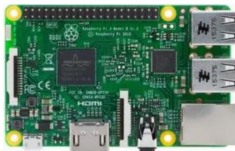
Fig 3: Raspberry pi 3

Quad Core 1.2GHz Broadcom BCM2837 64bit CPU 1GB RAM BCM43438 remote LAN and Bluetooth Low Energy (BLE) on board 40-stick broadened GPIO (General reason I/O) 4 USB 2 ports 4 Pole stereo yield and composite video port (simple video transmission) Full size HDMI (High Definition Multimedia Interface) CSI (camera sequential interface) camera sequential interface) show port for associating a Raspberry Pi touch screen show Micro SD port for stacking your working framework and putting away information Upgraded exchanged Micro USB control source up to 2.5A.The Raspberry Pi 3 is a MasterCard measured PC fit for doing pretty much anything a work area PC does.