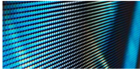
Fig 4: LED Display

A LED showcase is a level board show, which utilizes a variety of light-transmitting diodes as pixels for a video show.