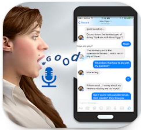
Fig 2: voice to text conversion using android app

For regions like railroad stations and other such bustling offices the station ace/host need not need to type in each declaration message physically on the screen.