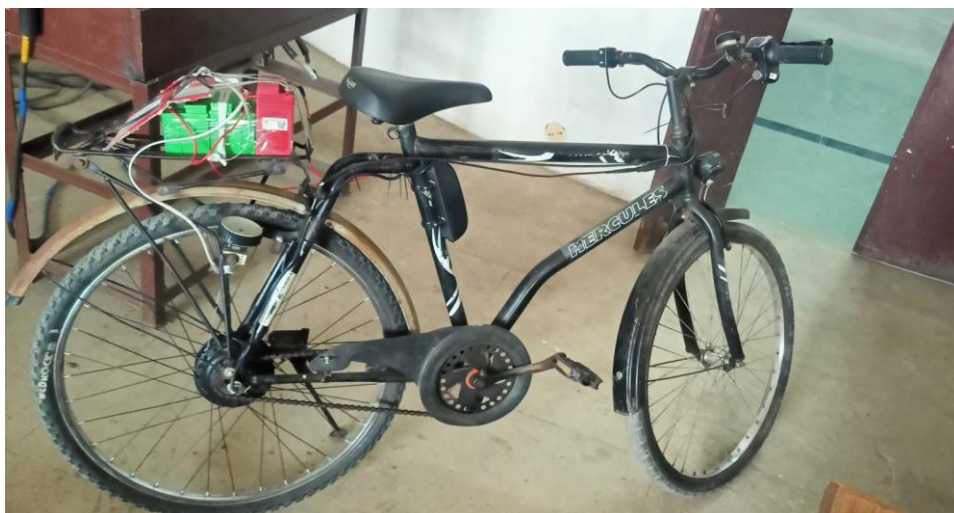
Fig 2: Prototype of self chargeable E-Bicycle using Dynamo