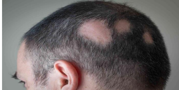
Fig 1: Alopecia Areata.

The many scientist work on COVID-19 vaccine showing 100% effect against the corona virus. There are about 21 vaccines available in market worldwide. The 137 vaccines are in clinical trials and about 194 vaccines are in the pre-clinical development[11].