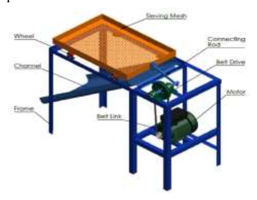
Figure 5: Sand sieving machine parts

Mechanical Design- The Figure 5 shows the sand sieving machine and its main parts. Where the machine was designed using Solid Work program [3]. The major purpose of the machine is to sieve the sand and make it free from impurities like grain and stones. The machine consists of a frame, wheels, channel, sieving mesh, connecting rod, belt drive, belt link, and motor. Where the frame used to support the body of the machine. The wheels are used as a support for the sieving mesh to move in the horizontal movement forward and backward [4]. While the channel uses allows the pure sand to flow in a specific place. The sieving mesh uses to filter the sand from impurities [5]. This mesh has different size holes, the use of each size comes as needed for the degree of purity of the sand from the impurities. As well as, the connecting rod used to move the sieving mesh after receiving the motion from the shaft. While the belt drive moved by the belt link after receiving the motion from the motor. Finally, the motor is responsible for the movement of the machine as a whole.