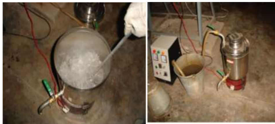
Figure 1: Stirring during the melting process

The waste plastics used by me for the process consisted mainly of HDPE products in the form of used plastic disposable glasses. A person was allotted for collecting the material. He collected the glasses that were used by students during the time of semester examination and the various functions taking place in our college.