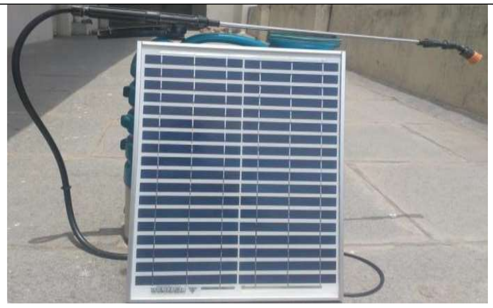
Figure 2: Fabricated solar pesticide sprayer

National Conference on Trending Technology for Achieving Sustainable Development Goals NCTTASDG 2023 Organized by Shri Shankarprasad Agnihotri College of Engineering, Wardha