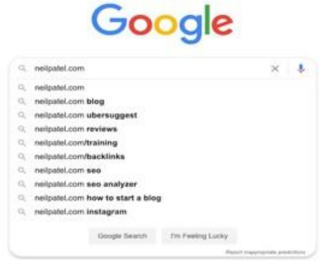
Figure 1: Google using next word prediction

The feature indeed makes composing documents easier and faster. However, not all users like to see word/phrase suggestions while writing.