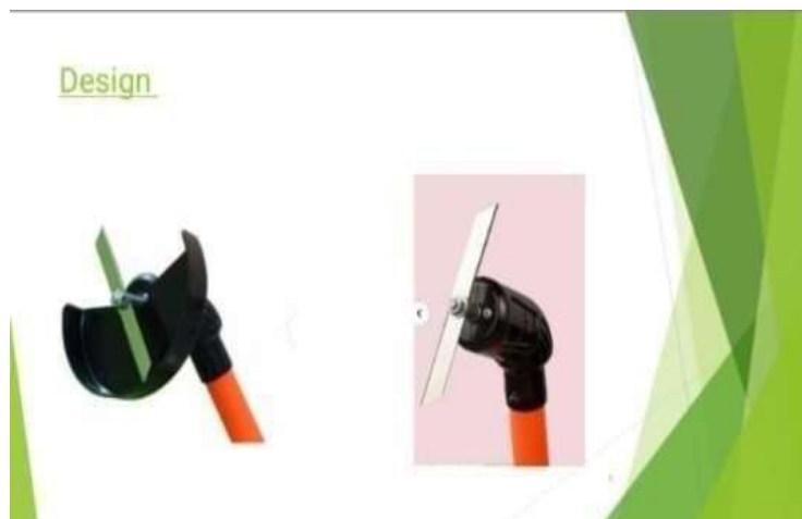
Figure 2: Name of Graph (Font size-10)